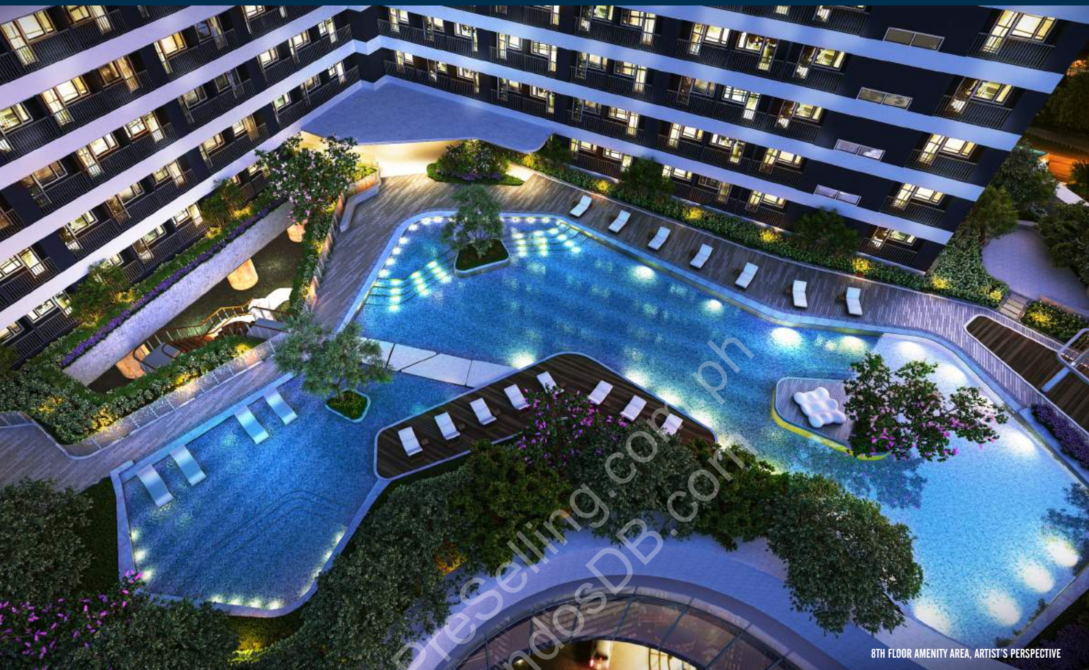
8TH FLOOR AMENITY AREA, ARTIST'S PERSPECTIVE