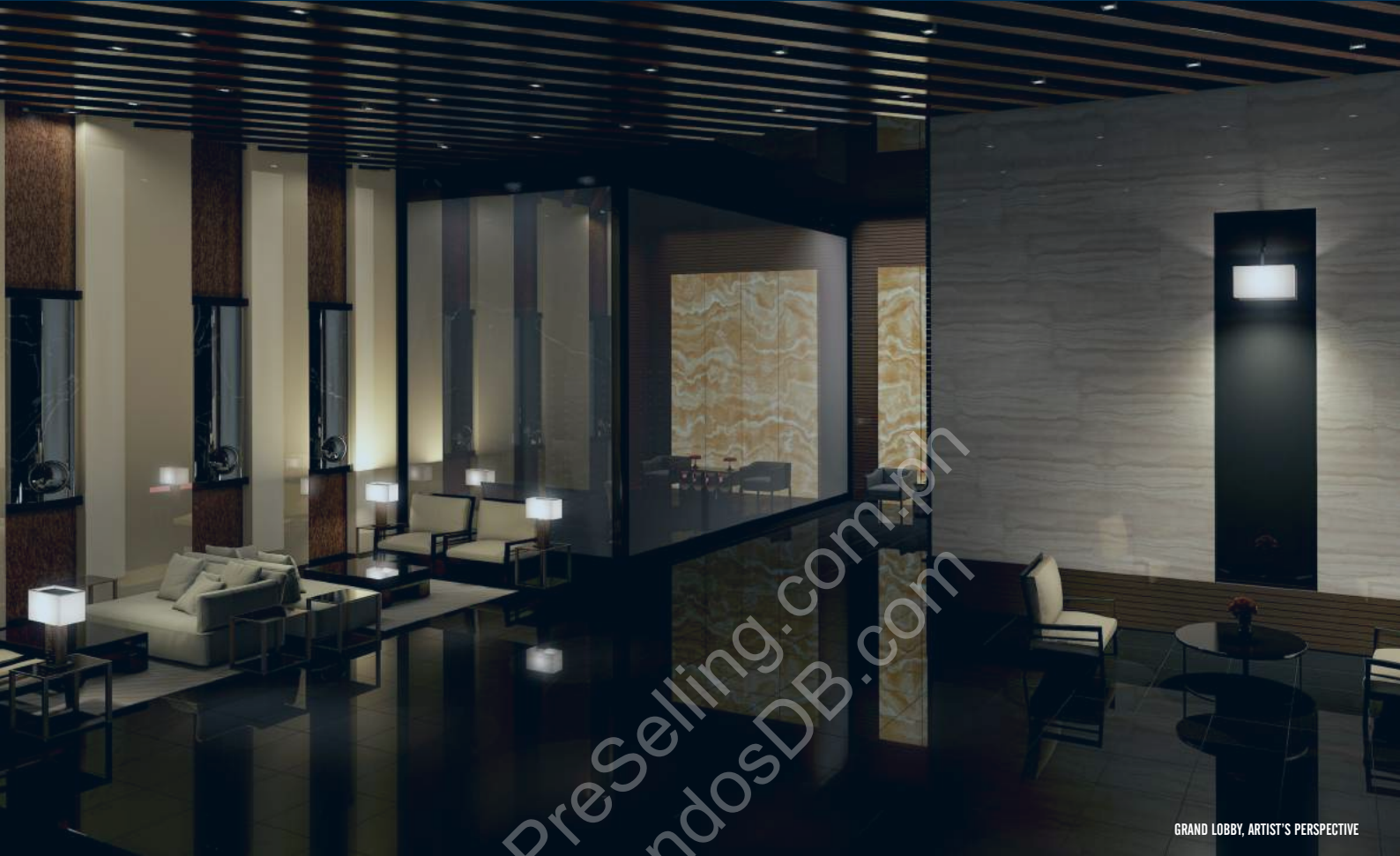
GRAND LOBBY, ARTIST'S PERSPECTIVE