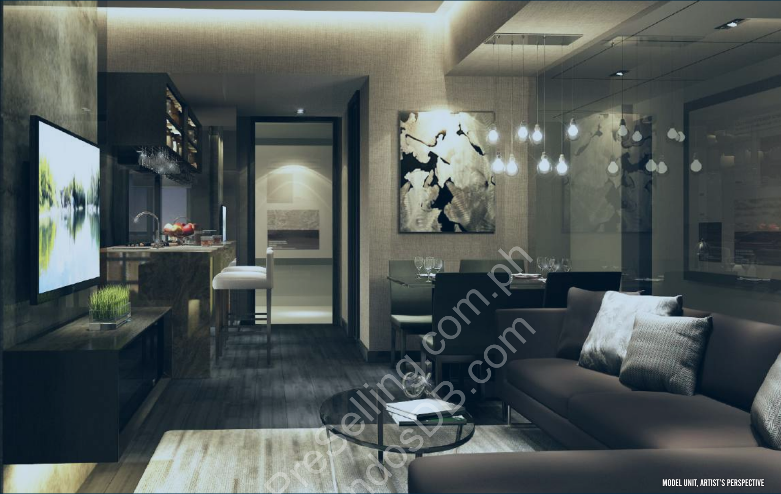
MODEL UNIT, ARTIST'S PERSPECTIVE