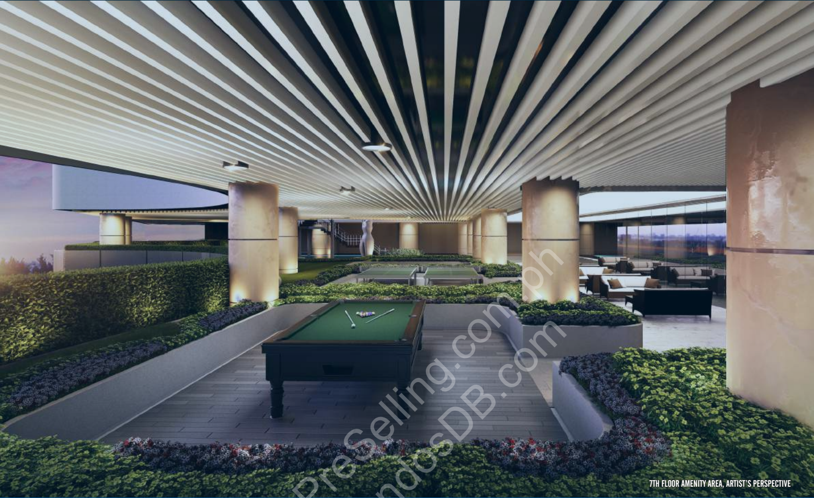
7TH FLOOR AMENITY AREA, ARTIST'S PERSPECTIVE