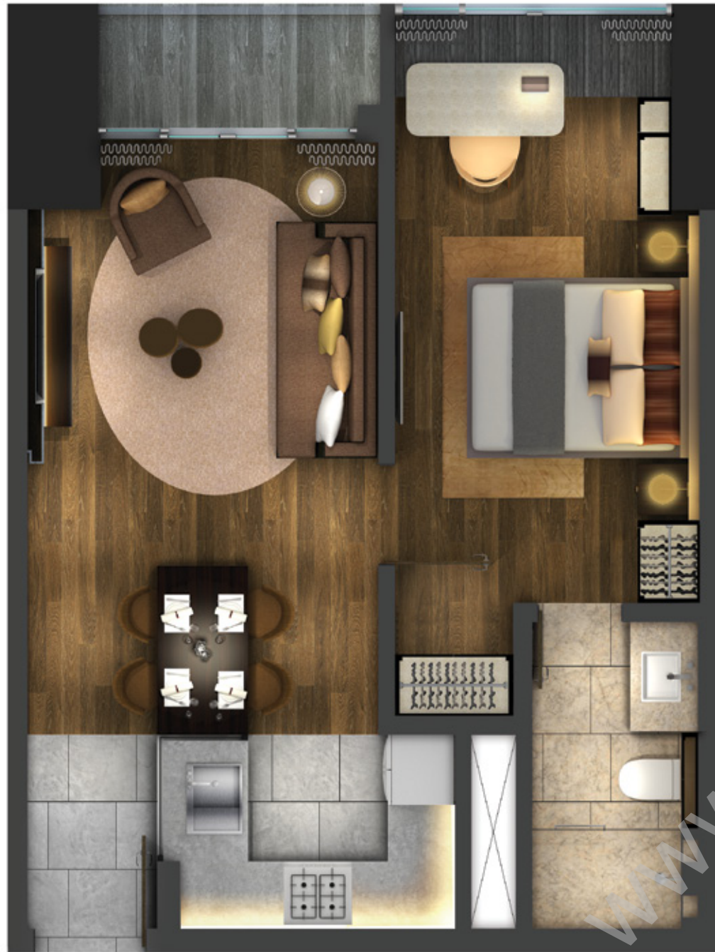
Artist's image for illustration purposes only