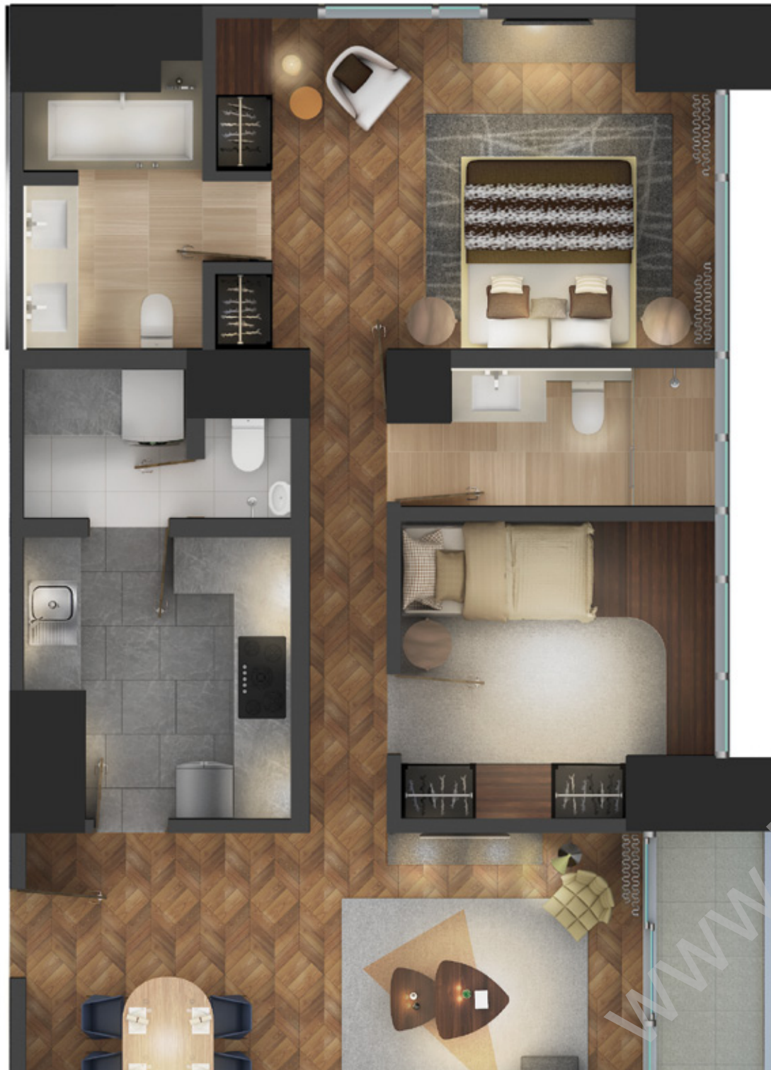
Artist's image for illustration purposes only