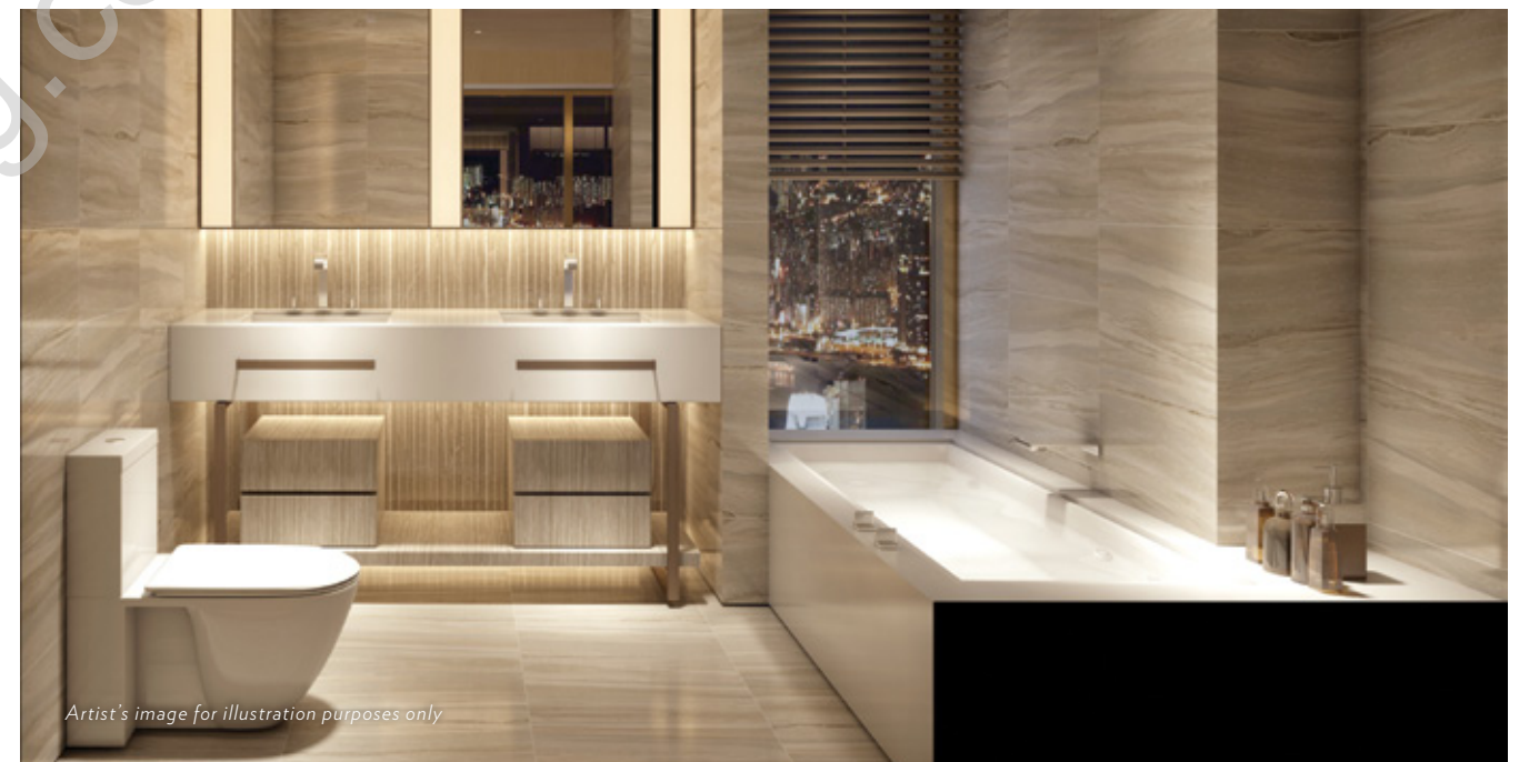
Artist's image for illustration purposes only

Perfect for families, our two bedroom unit encompasses a perfect balance of space, storage and elegance. Enjoy a spacious master bathroom layout complete with his and hers sinks, or unwind in a tranquil bath as you look out onto the city view below. The generous kitchen space and the additional utilities room opens up to new lifestyle opportunities.