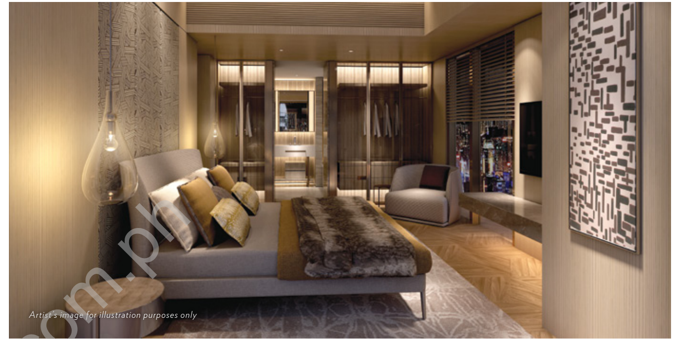
Artist's image for illustration purposes only