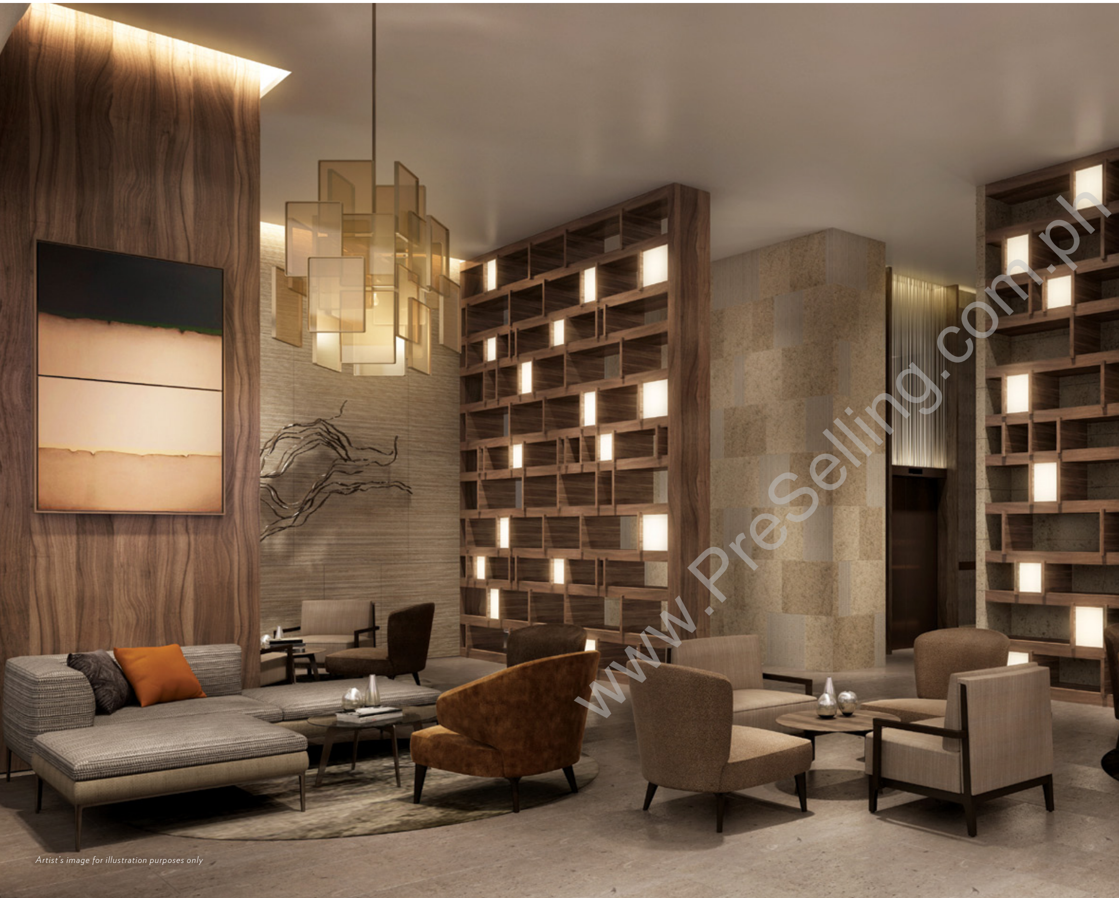
Artist's image for illustration purposes only