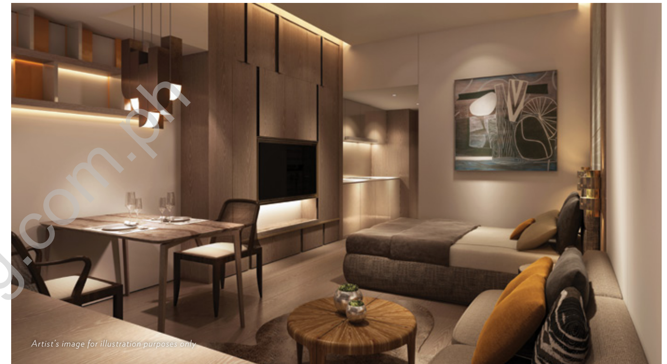
Artist's image for illustration purposes only

Our finely crafted studio units are designed to meet the needs of driven individuals on the move. This condominium offers open plan living with ample space for a queen-size bed and a well equipped kitchen.