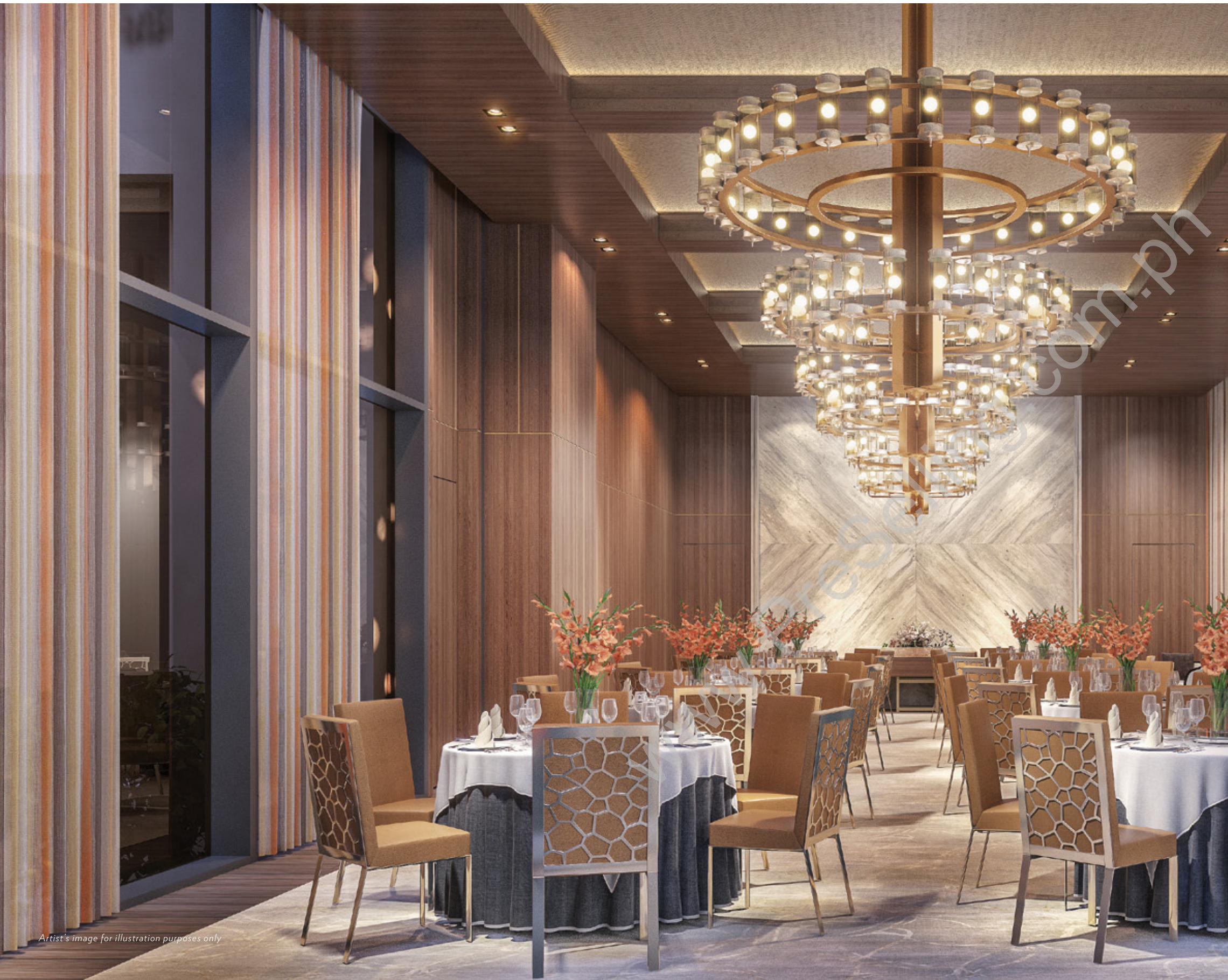
Artist's image for illustration purposes only