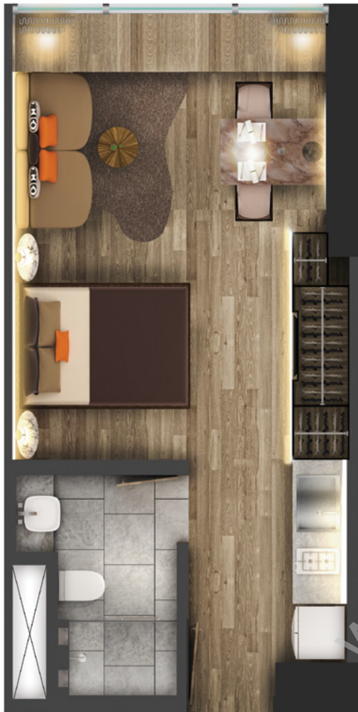
Artist's image for illustration purposes only