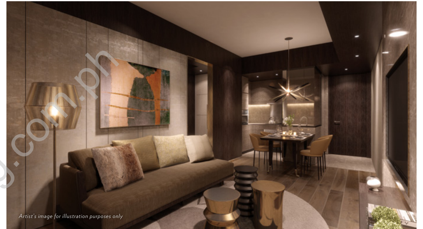
Artist's image for illustration purposes only

The generous one bedroom unit is perfect for those looking for additional space to spread out and relax. It comprises separate dining and living areas with ample kitchen space for entertaining. The additional en suite bathroom through the walk in closet gives you options for additional storage as you grow.