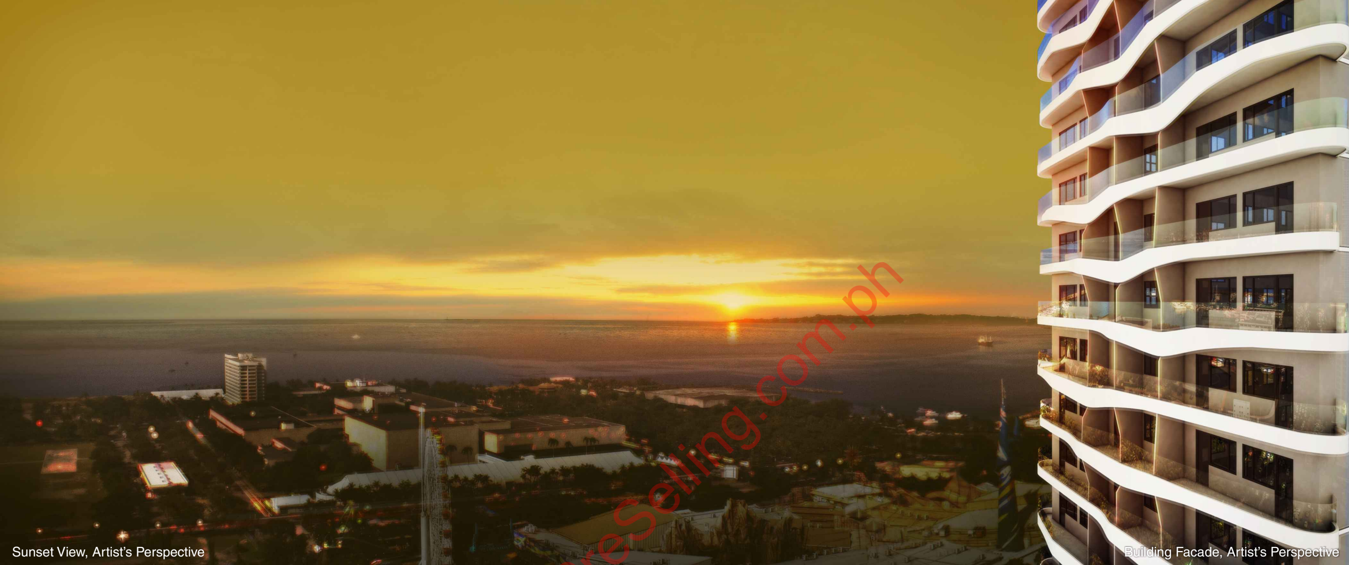
Sunset View, Artist's Perspective