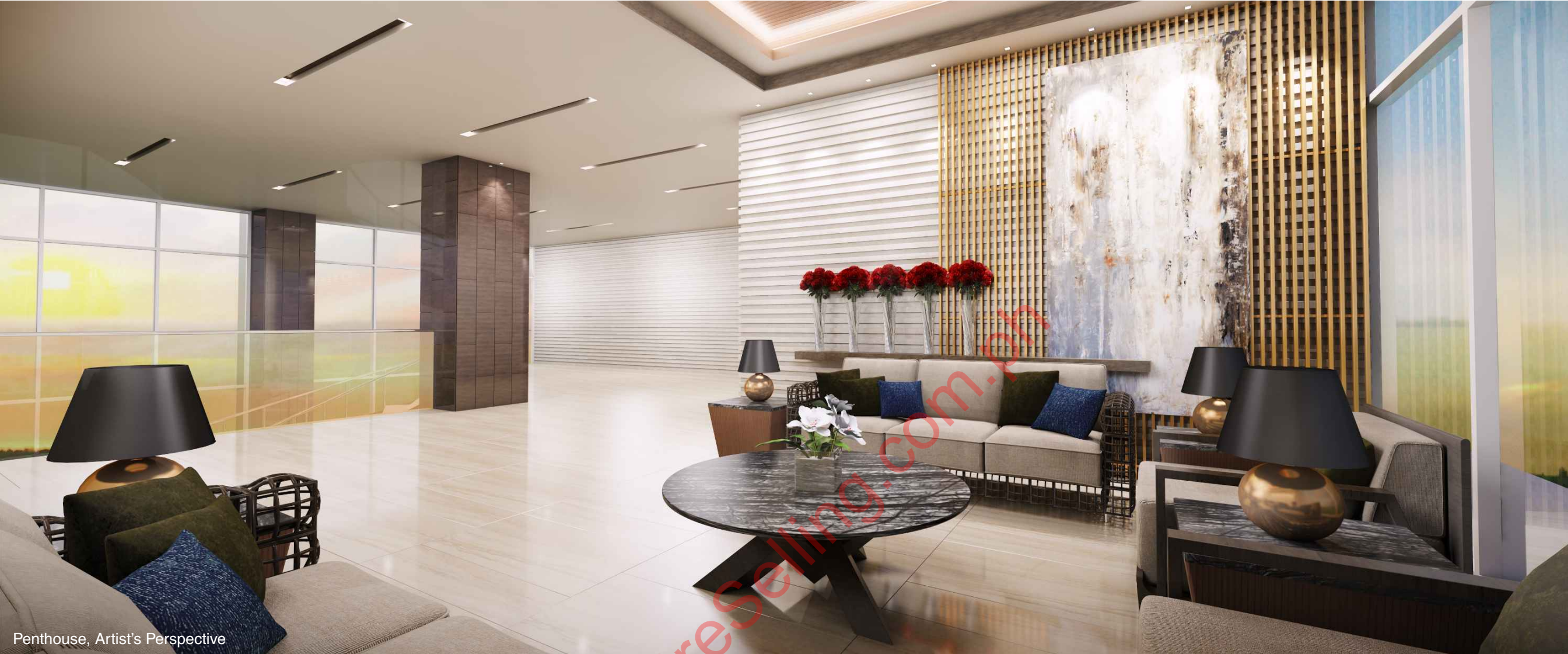
Penthouse, Artist's Perspective