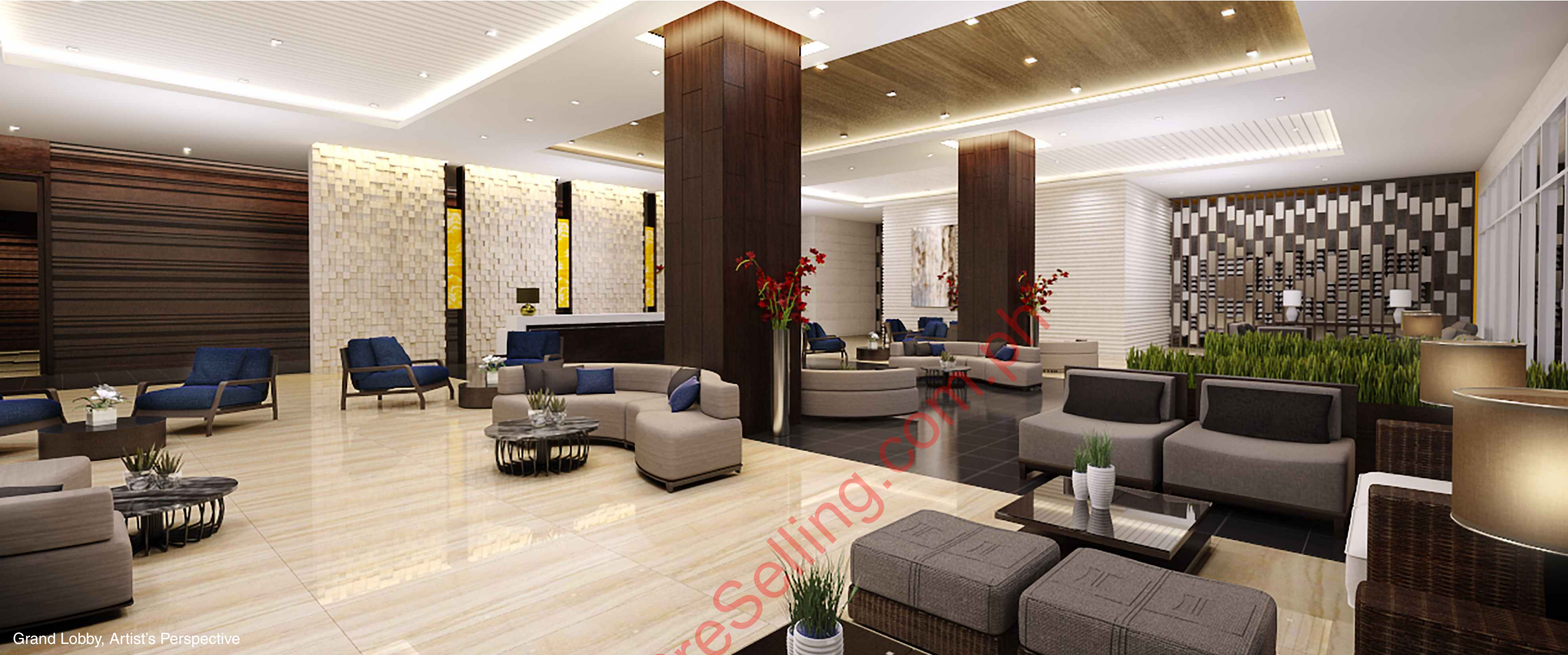
Grand Lobby, Artist's Perspective