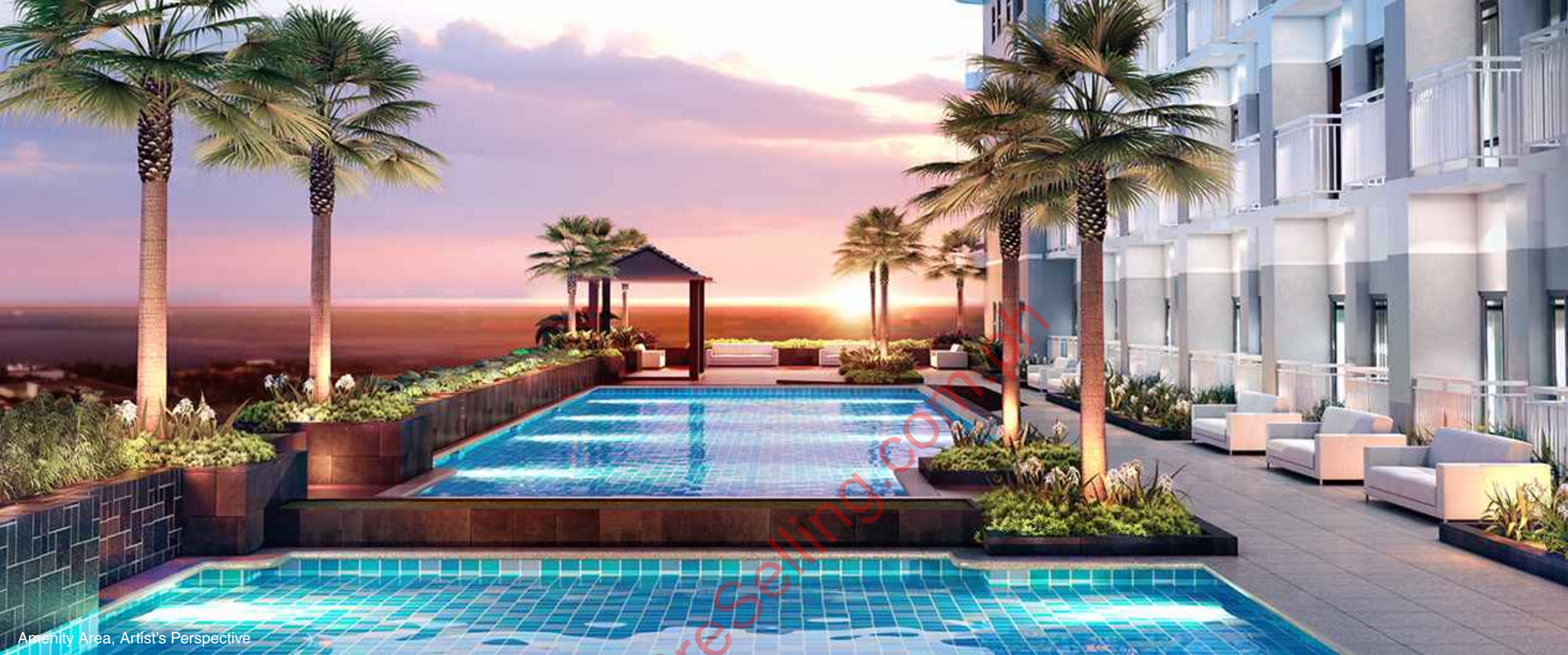
Amenity Area, Artist's Perspective