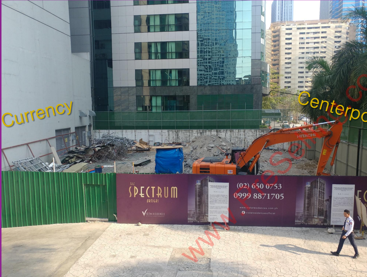
Spectrum: Tower 2 of Currency

Julia Vargas cor. Garnet Road, Ortigas Center, Pasig City, 1605