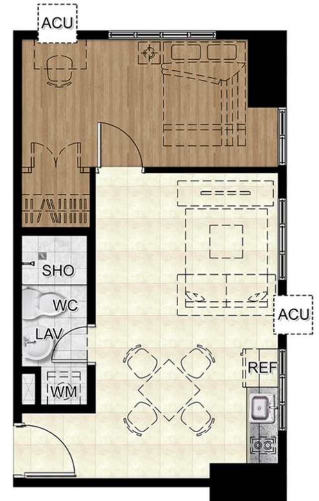
1-BEDROOM UNIT 40.85 sqm.