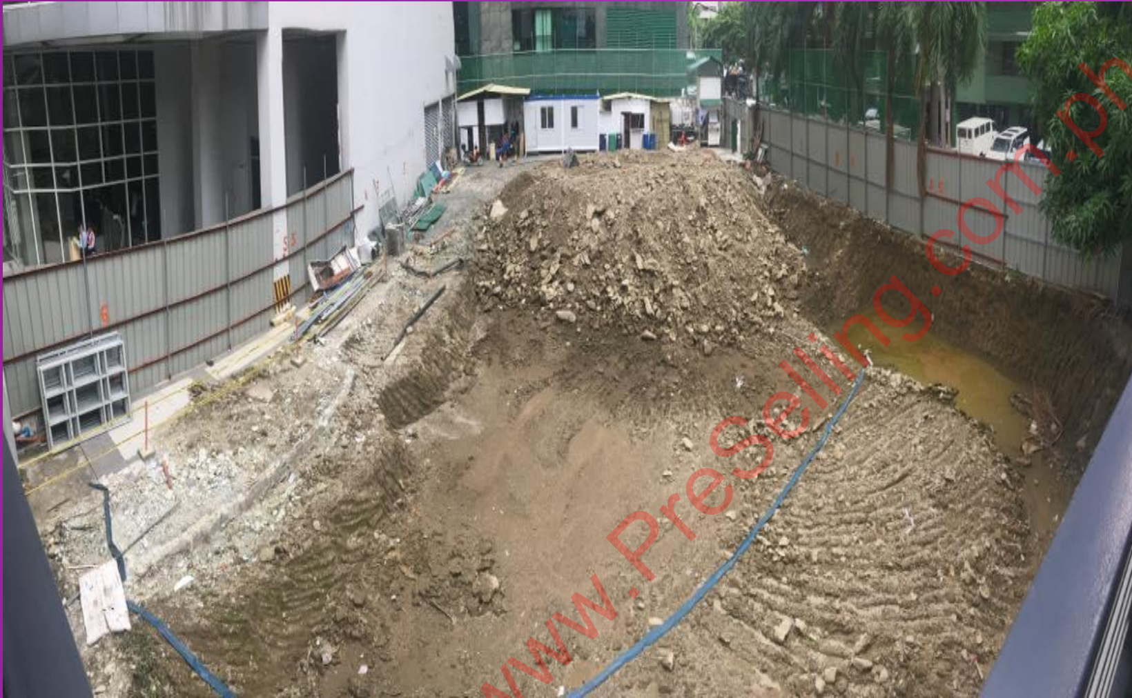
Front Elevation August 15, 2019