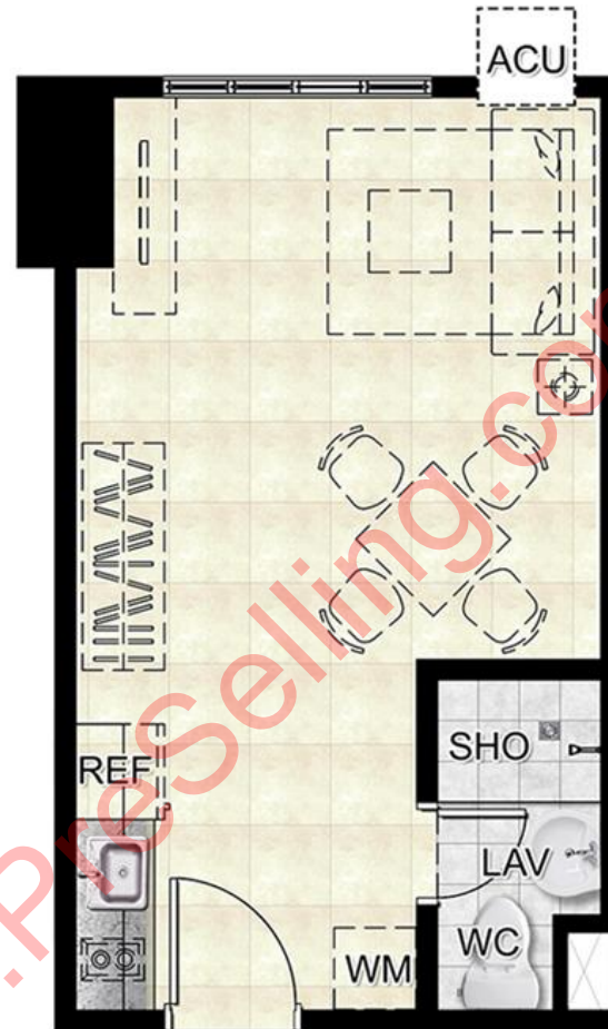
STUDIO UNIT (C) 28 sqm.