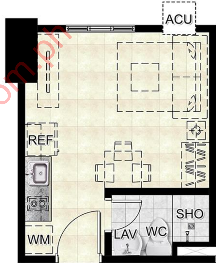
STUDIO UNIT (B) 21.37 sqm.