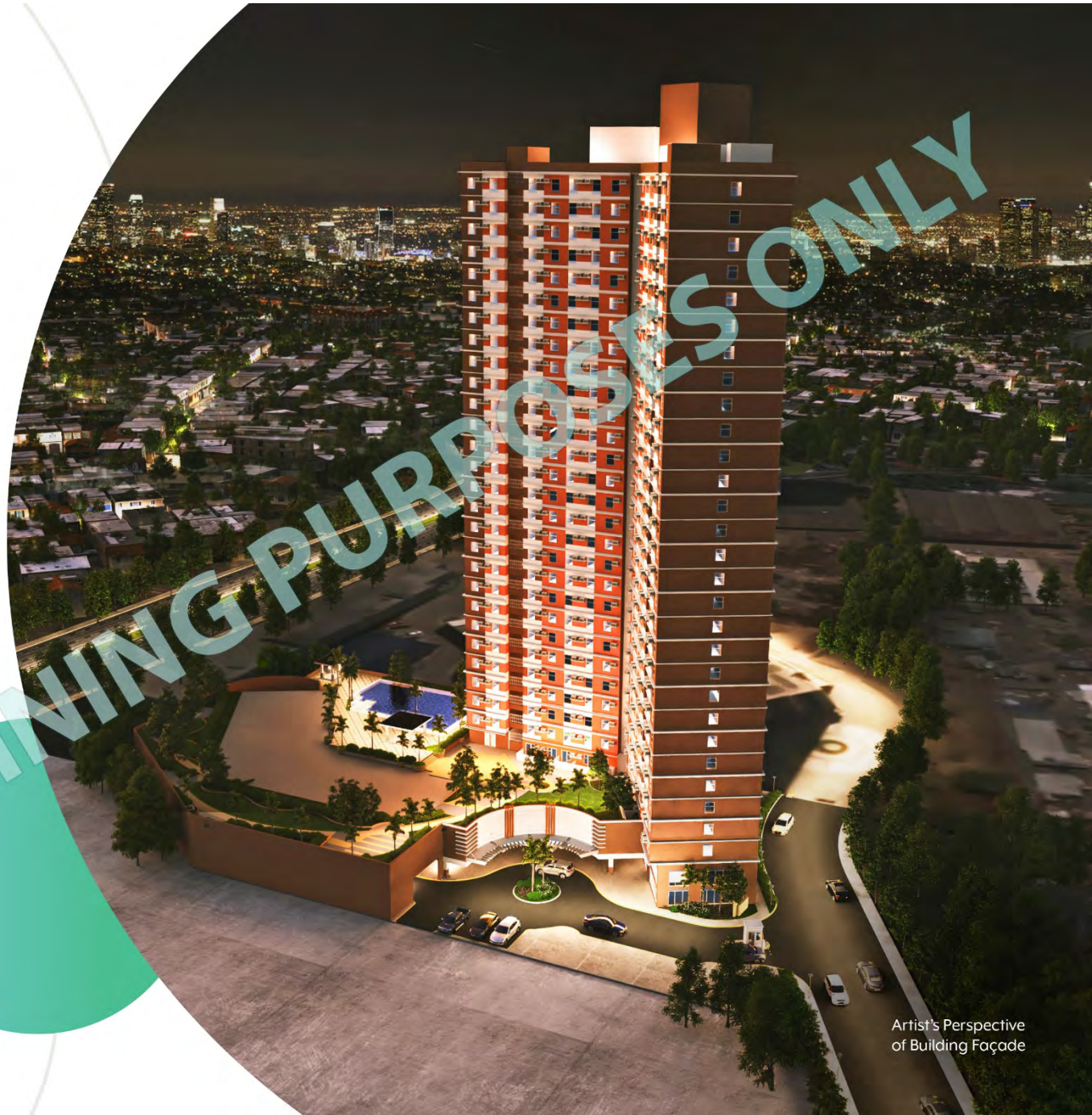
Artist's Perspective of Building Façade