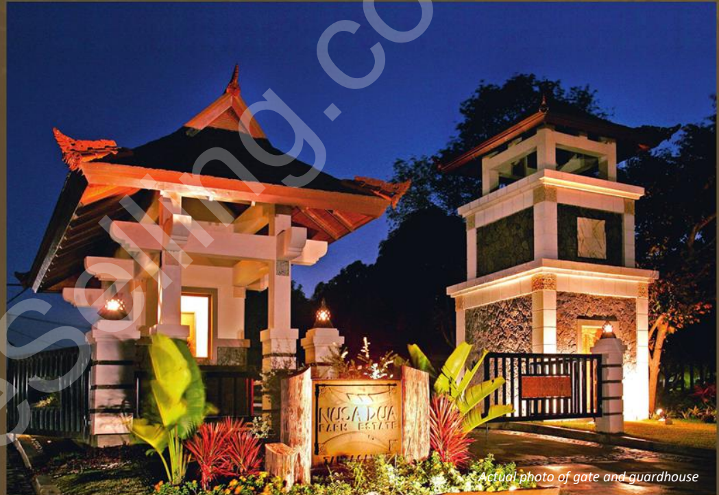
Actual photo of gate and guardhouse

Residential lots (with ample spaces for gardening, hobby farming)