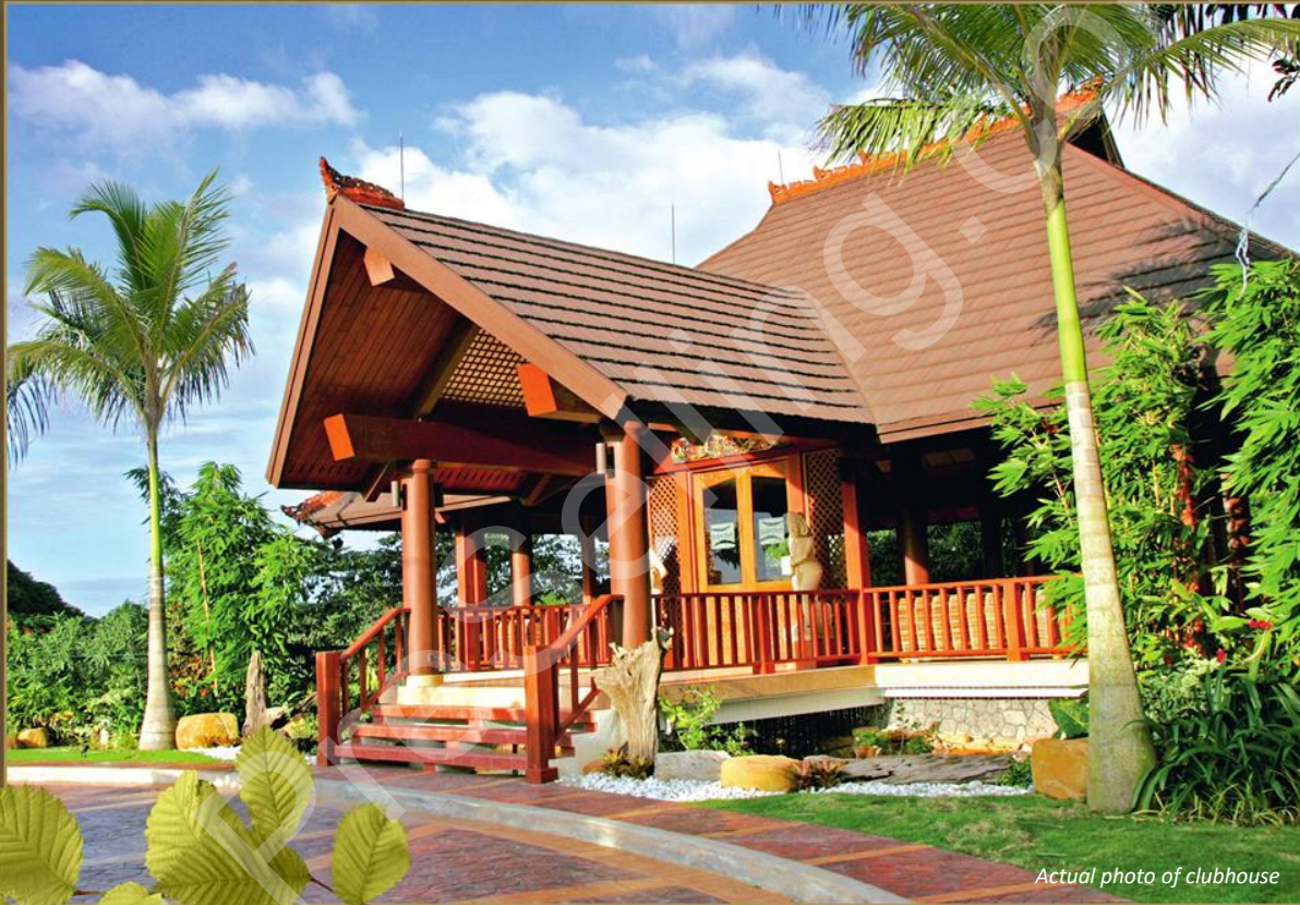
Actual photo of clubhouse

A song of outdoor discoveries Of lyric and rhyme and nature's mysteries Excitement and joy and pure bliss Days of relaxation you shouldn't dare miss