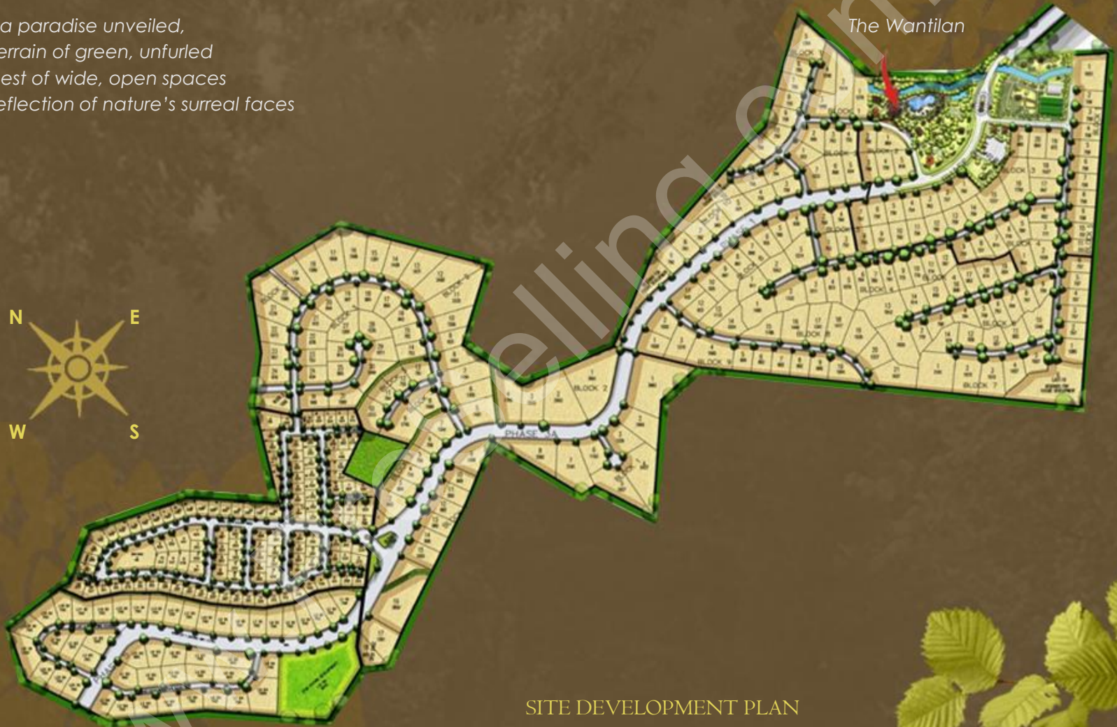
SITE DEVELOPMENT PLAN

It's a paradise unveiled, A terrain of green, unfurled A nest of wide, open spaces A reflection of nature's surreal faces