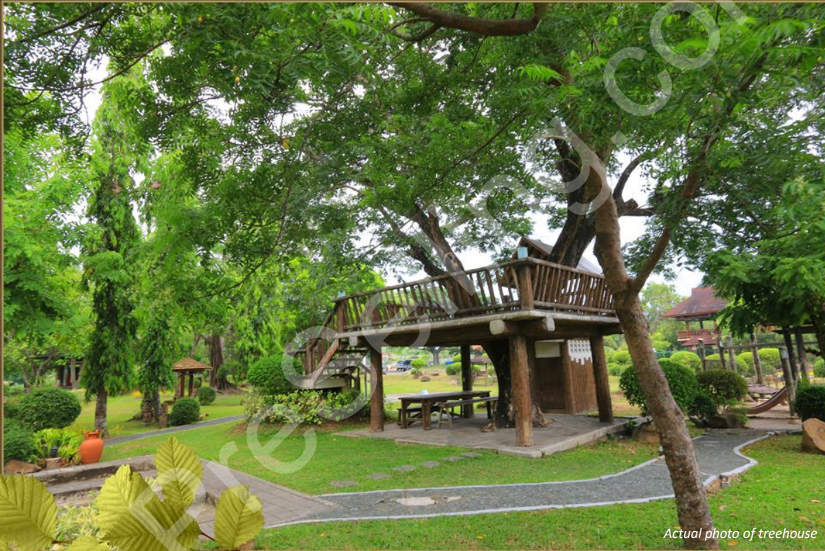
Actual photo of treehouse

Dare to play and roam Trade blacks and whites, monochromes For greens and yellows and vibrant blues A rainbow of experiences await, a spectrum of hues