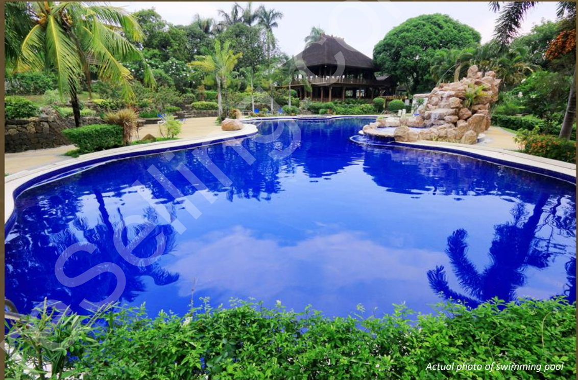
Actual photo of swimming pool

Where the birds go a-chirping, Where hours of fun are a-fleeting A place of enjoyment Your Garden of Eden