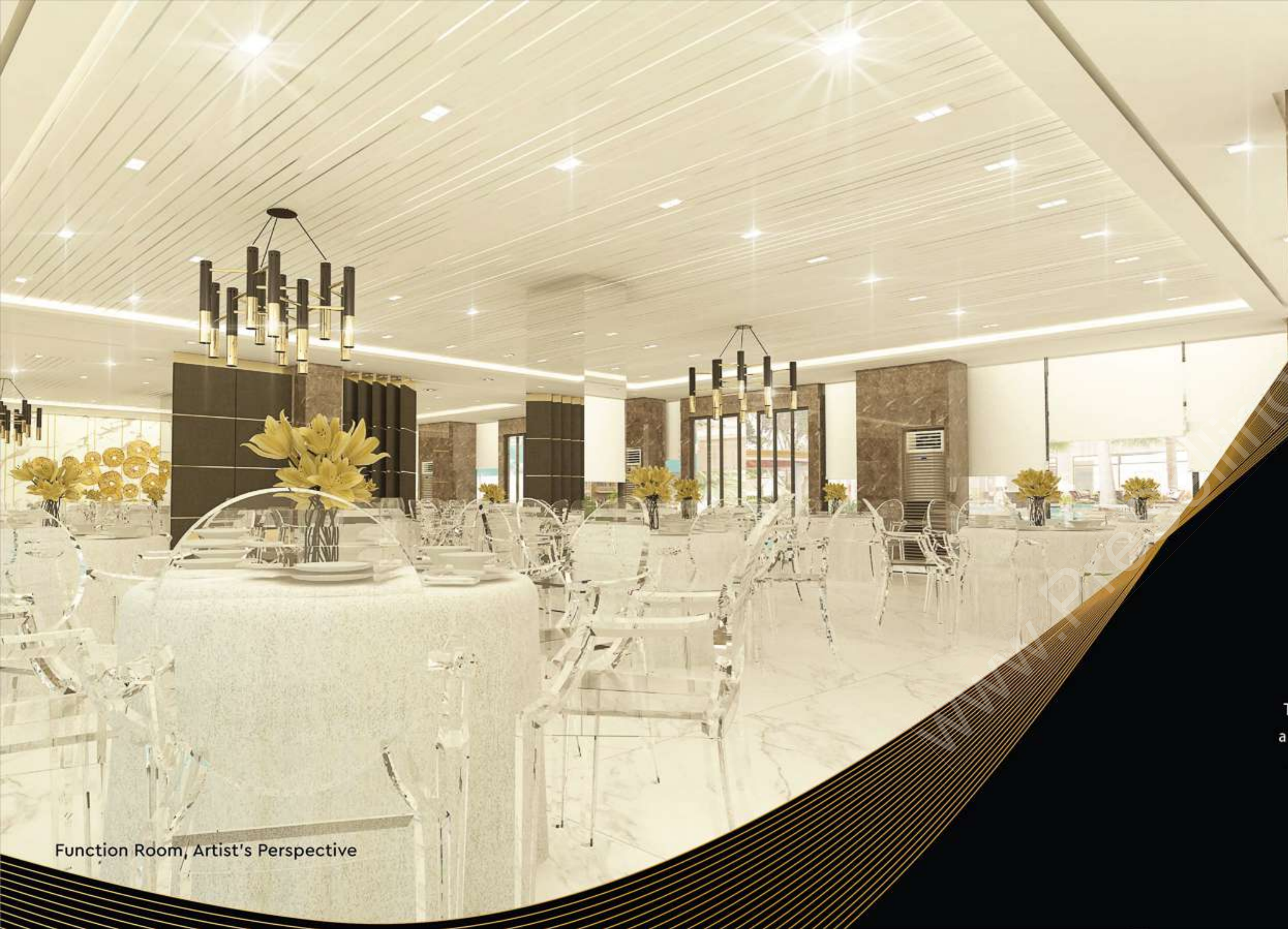
Function Room, Artist's Perspective