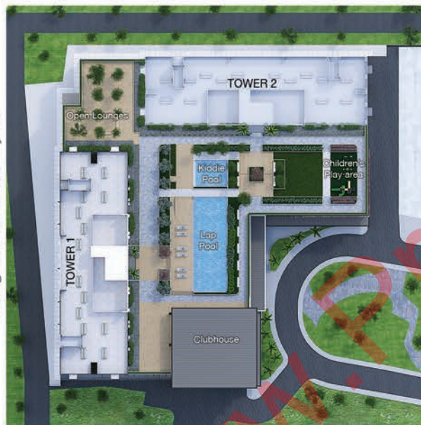
SITE DEVELOPMENT PLAN Facing Laguna de Bay