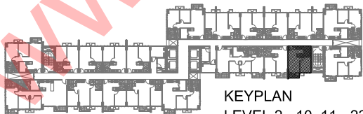
KEYPLAN LEVEL 2 - 10, 11 - 23