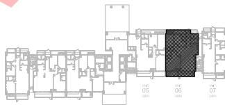
KEYPLAN GROUND FLOOR